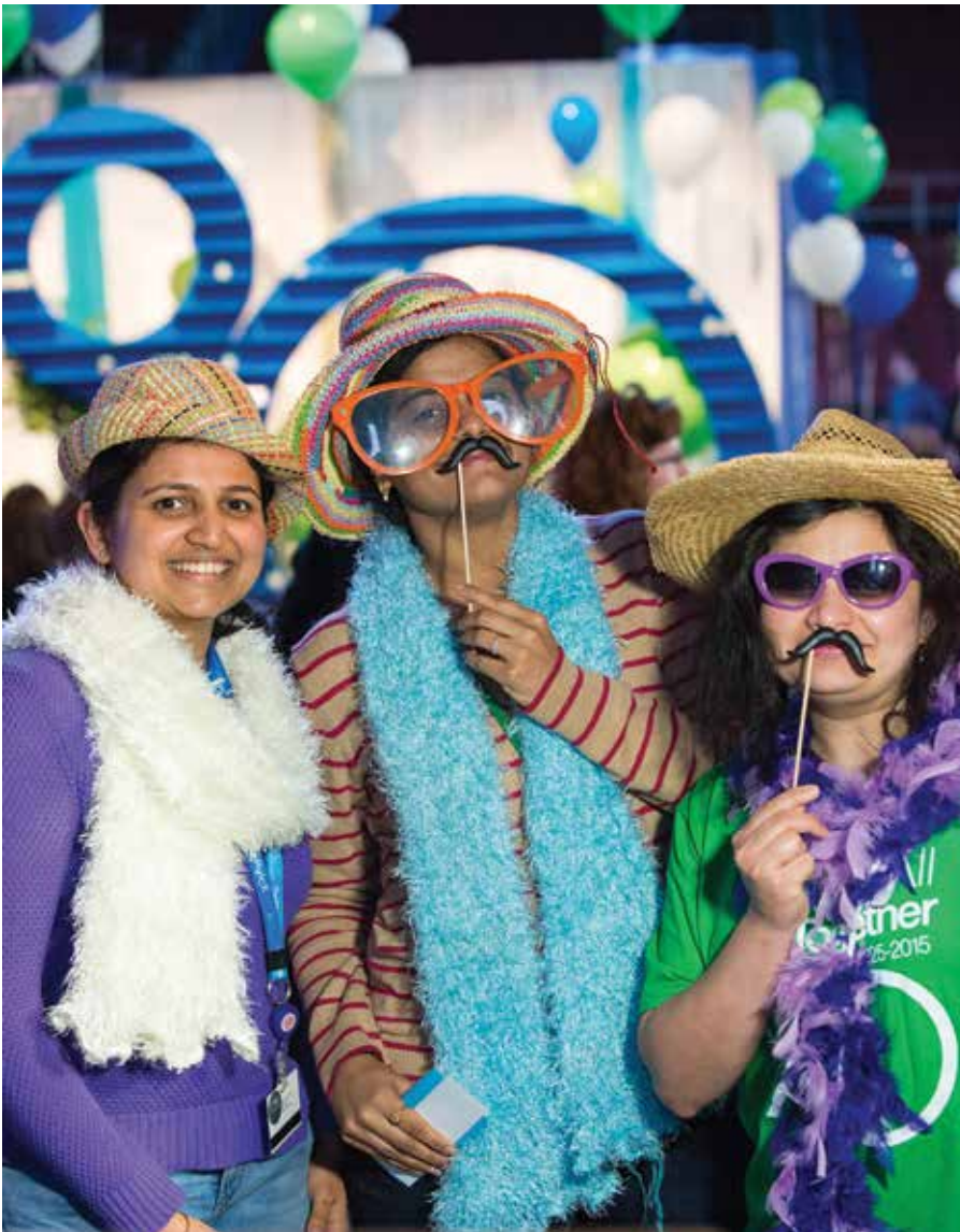
During an employee appreciation party, ERIE employees enjoy using a photo booth with props.

In its 90th year alone, ERIE's charitable giving included supplying backpacks and tutoring students at elementary schools, donating to training programs for at-risk youth, sponsoring community festivals, cleaning up neighborhood garden beds, repainting homes for those who physically could not and fighting hunger by helping local food pantries and kitchens.