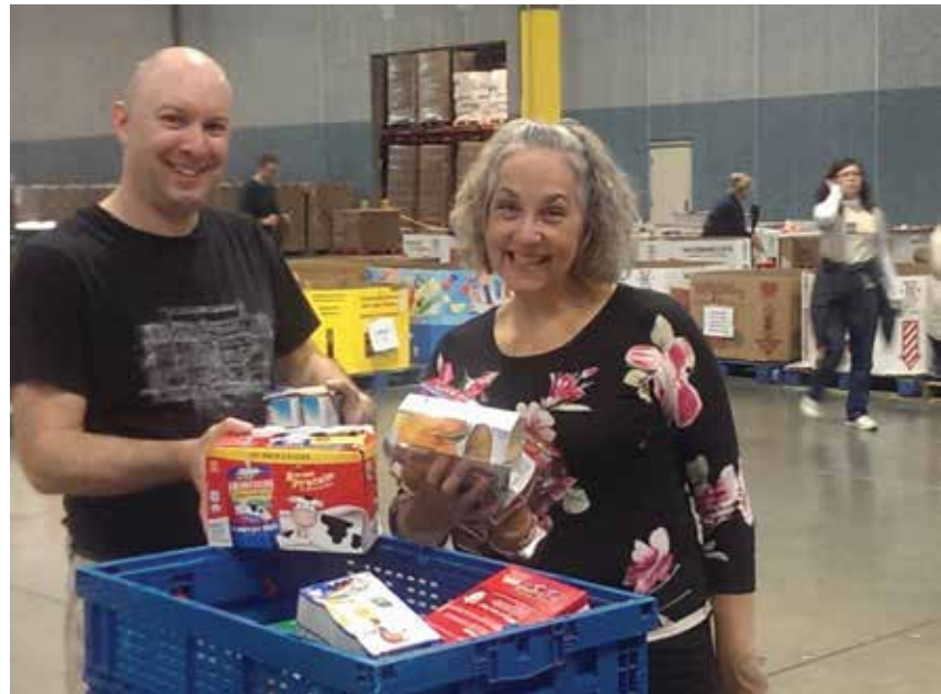
PLM/ILM employees hard at work at The Habitat for Humanity Restore in Philadelphia and separating food into categories for distribution in Indianapolis.

Whether it was cleaning furniture, clearing books or sorting food, everyone had a rewarding experience serving their community. PLM/ILM is proud of all of its employees for their involvement and commitment to the United Way and its various agencies, and the company looks forward to continuing to be involved by helping the communities in which it serves and lives. ■