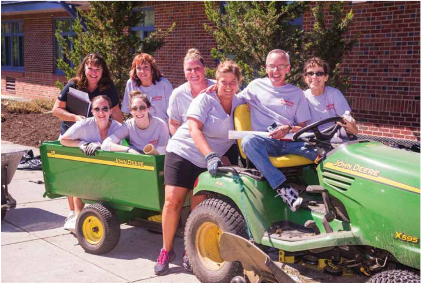
Left: Children participate in a soccer clinic sponsored by MAPFRE Insurance; top, MAPFRE employees clean the grounds at Webster Middle School and, bottom, MAPFRE employees gather together before heading out to assigned jobs.

dribbling and shots on goal. The drills were followed by scrimmages that helped to reinforce the skills the children had just learned.