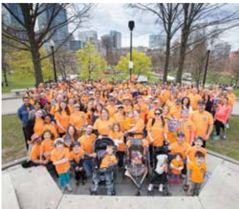
Team Arbella at the annual Walk for Hunger; Arbella employees tend the garden at Interfaith Social Services in Quincy, Massachusetts.