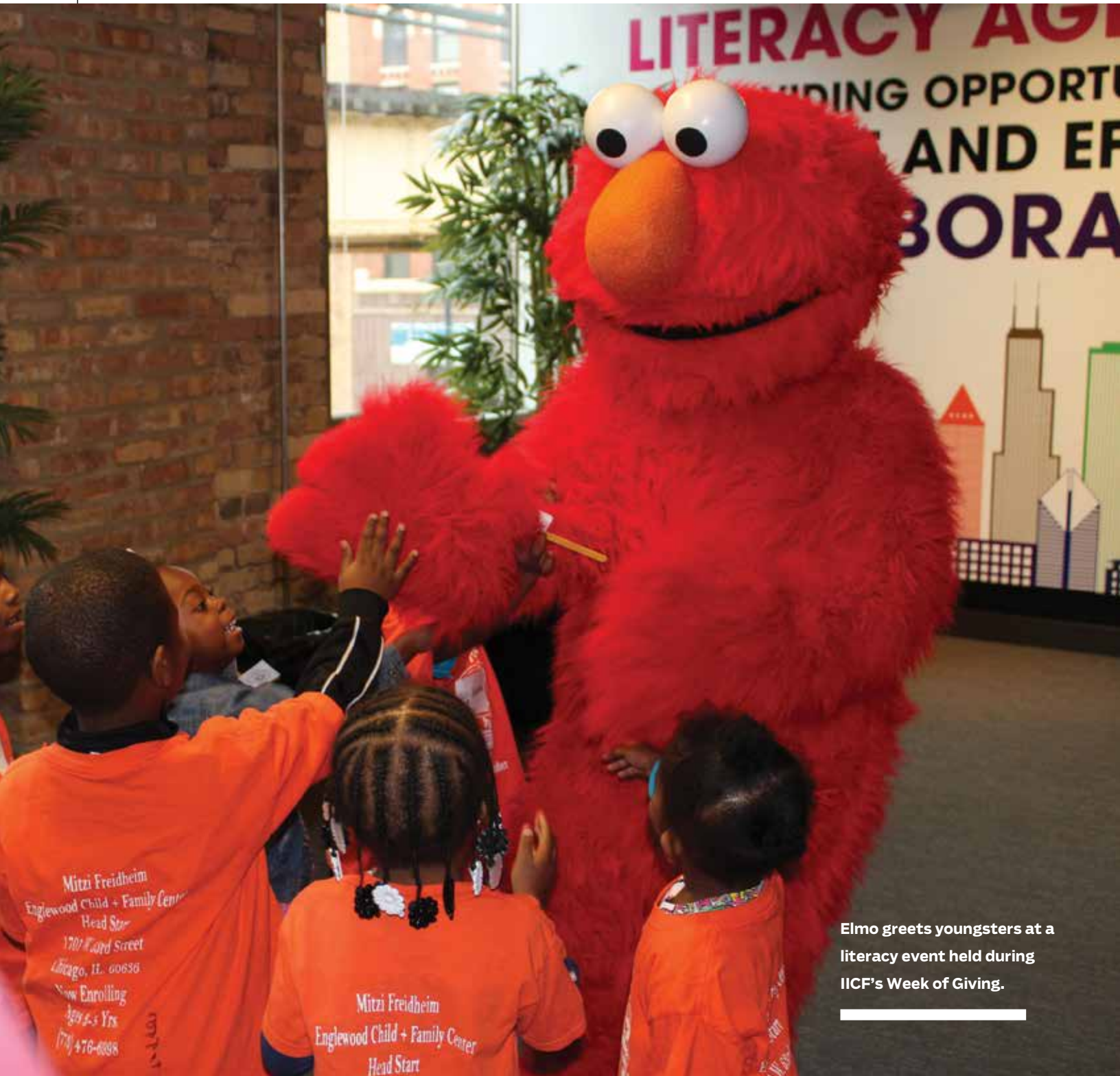
Elmo greets youngsters at a literacy event held during IICF's Week of Giving.